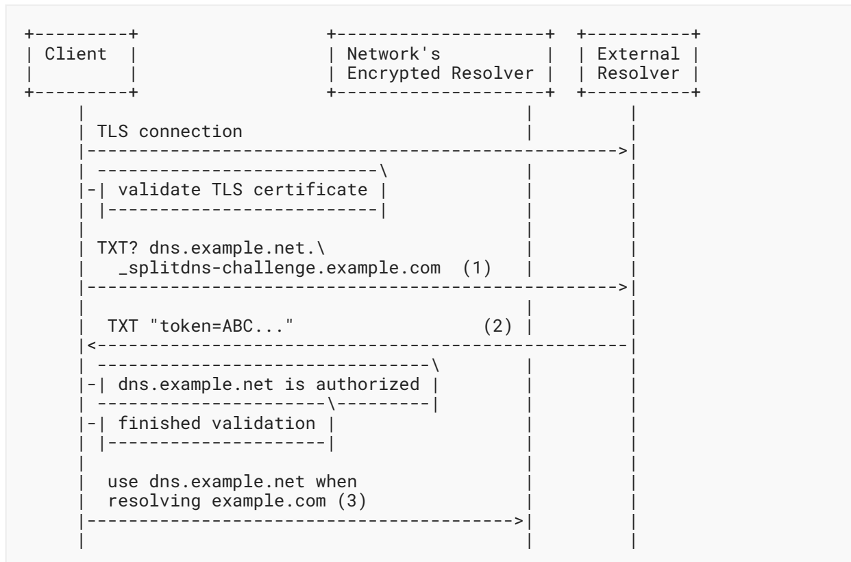
Figure 3: Verifying Claims Using an External Resolver