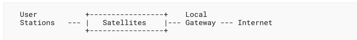
Figure 1: Overall Network Architecture

Satellites may have data interconnections with one another through Inter-Satellite Links (ISLs). Due to differences in orbits, ISLs may be connected temporarily with periods of potential connectivity computed through orbital dynamics. Multiple satellites may be in the same orbit but separated in space with a roughly constant separation. Satellites in the same orbit may have ISLs that have a higher duty cycle than ISLs between different orbits, but they are still not guaranteed to be always connected.